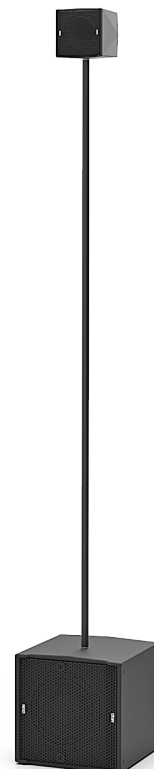
IDS108 deployed with ID14 and thin pole accessory.

The IDS108 shares the same phase response as other NEXO speakers, making it extremely easy to mix with other NEXO systems, e.g with the larger MSUB18 or with other NEXO subs, without risk of comb filtering or requiring complex electronic adjustment.